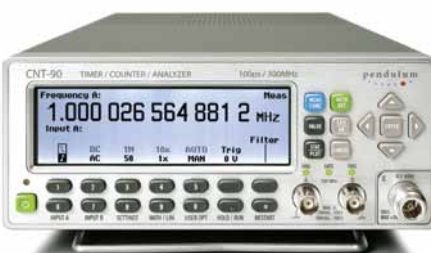
Figure 3: Input parameter setting menu shown with measured result.