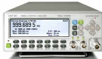
Figure 4: Display showing different statistical parameters viewed at the same time.