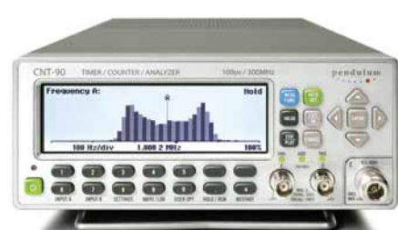
Figure 6: The same result as in Figure 5, now displayed as a histogram.