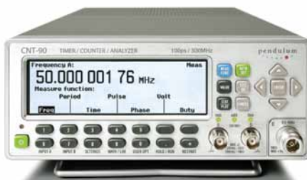
Figure 2: Measure function selection menu, shown with measured results.