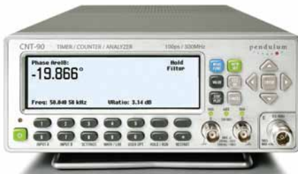
Figure 1: Display showing phase value, frequency, attenuation Va/Vb, and auxiliary parameters.

When adjusting a frequency source to given limits, the graphic display gives fast and accurate visual calibration guidance.