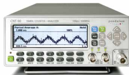
Figure 5: Display showing the trend (signal over time) of sampled data.